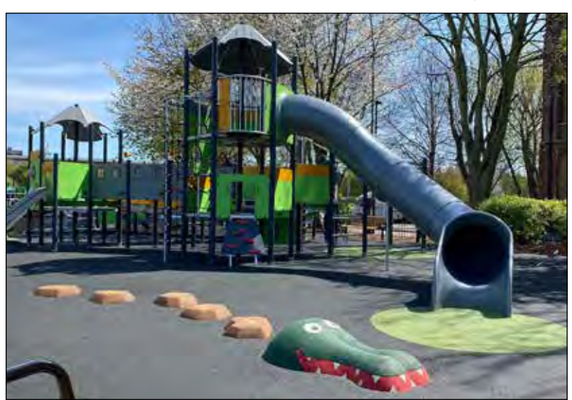
Inclusive playgrounds for children of all ages are some of the exciting developments in the borough's parks

For further information and updates visit www.towerhamlets.gov.uk/parks