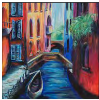
Venice by Virginia Hawke