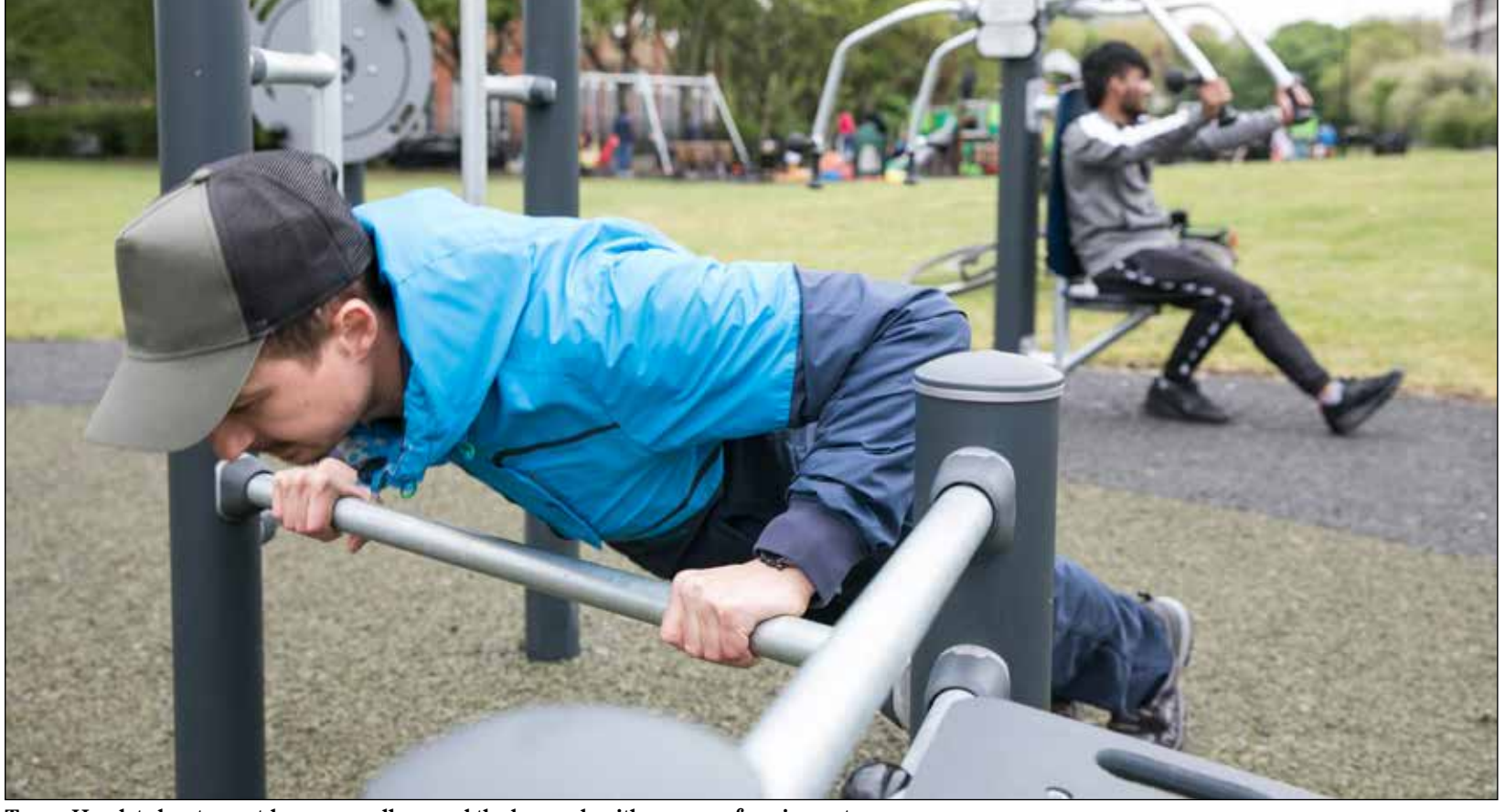
Tower Hamlets has ten outdoor gyms all around the borough with a range of equipment