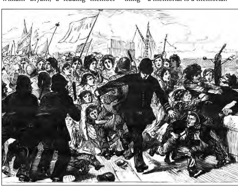
The Metropolitan Police tried to stop the marchers, at times with brute force