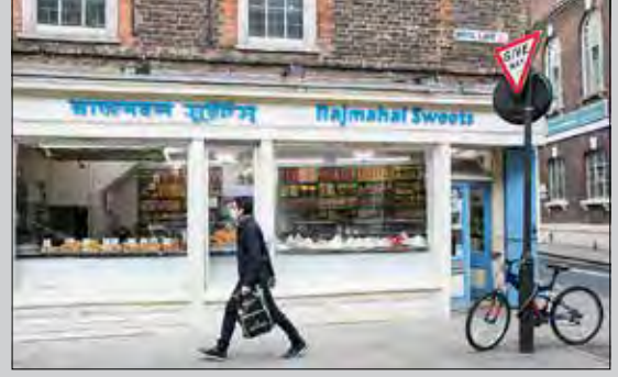
(3) Sweets and savouries on Brick Lane

As the lockdown continues to ease - step by step - the shops, restaurants, markets and pubs in Spitalfields are waking up once again. Dining at home and shopping online is all well and good, but maybe you feel ready now to head out for a meal with friends or to browse at interesting shops and market stalls? Local businesses are sure to appreciate the support. On this route you'll take a gentle stroll around Brick Lane, Spitalfields Market and historic side streets in between. The options for eating and shopping are plentiful - so