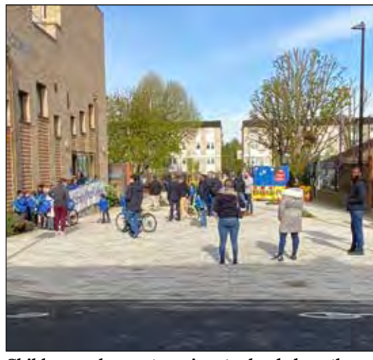
Children and parents arrive at school along the newly pedestrianised Glenworth Avenue

The council is committed to delivering 50 School Streets by 2022 which will improve road safety for communities across Tower Hamlets, as well as encouraging active travel and reducing pollution.