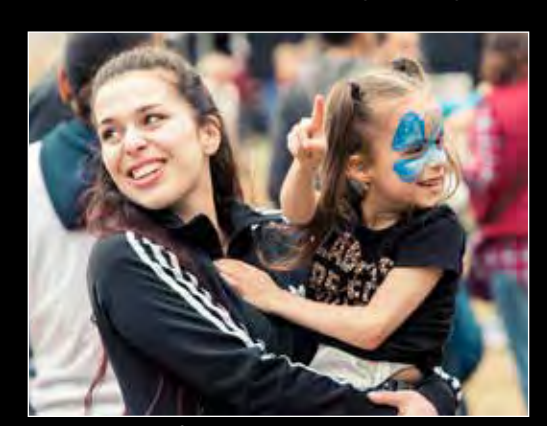
Fun activities for everyone at In the Neighbourhood.

For up-to-date information, including ticket competitions and draws, sign up to the council's newsletter at www.towerhamlets.gov.uk/signup