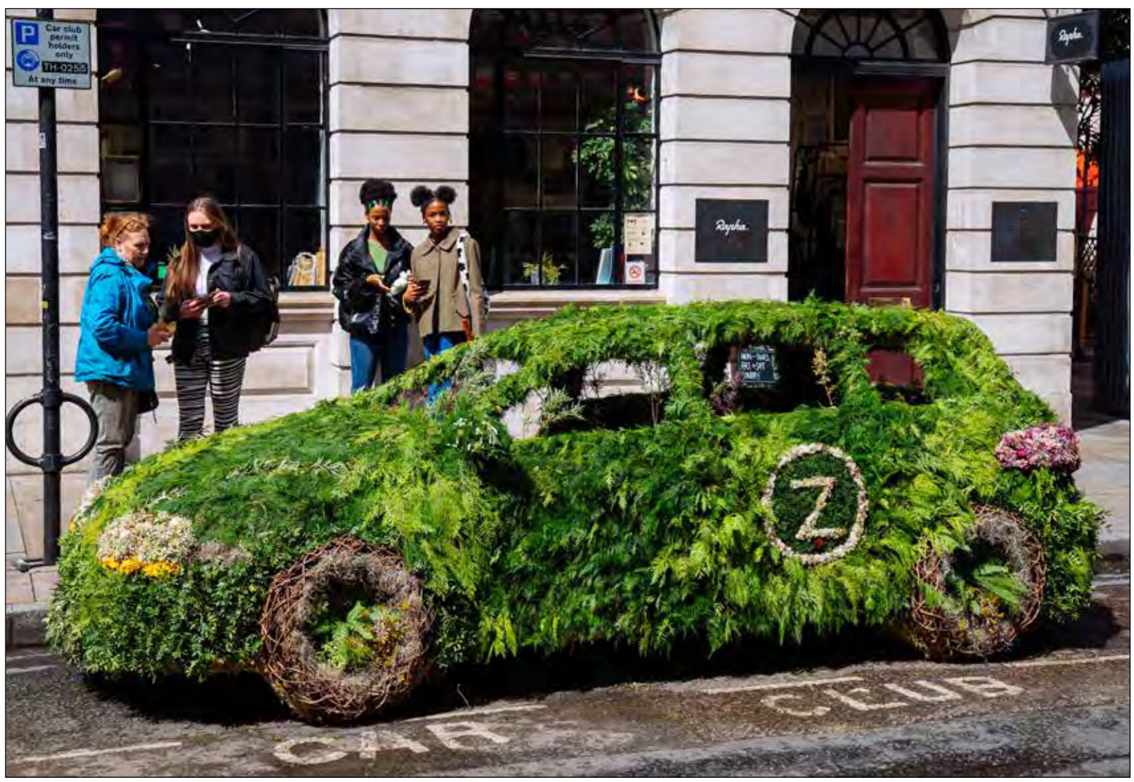
Zipcar UK's 'Living Car' installation on Brushfield Street beside Spitalfields Market