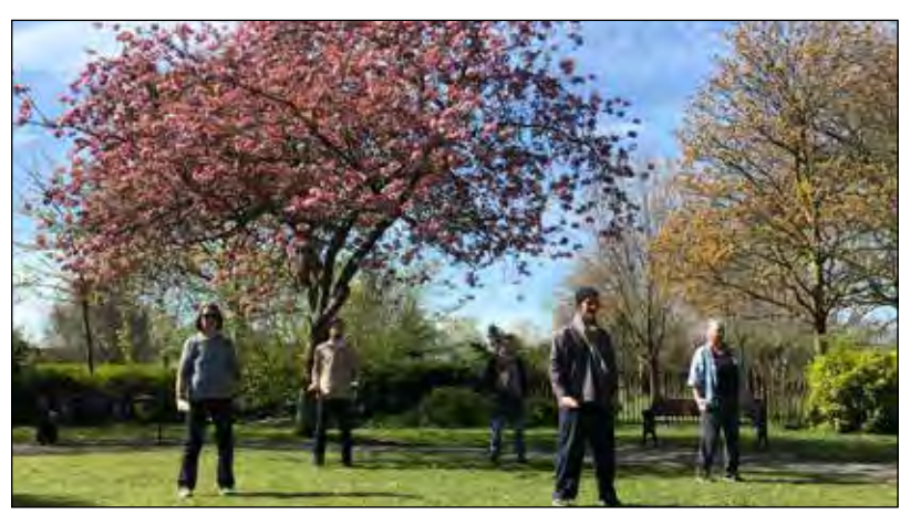
The Health Tree project takes a holistic approach to wellbeing