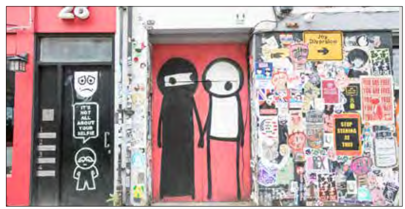
Street artist Stik's hand-holding couple stand out on Princelet Street

Brick Lane Jamme Masjid (6) encapsulates the flux of Spitalfields' residents over the centuries. Built in 1743 as a Huguenot chapel for French Protestants, it later served as a Methodist chapel and synagogue, before being converted in 1976 into the mosque. The silver minaret lights up with a cycle of colours, and the sundial inscription reads 'Umbra Sumus' or 'We are Shadows'.