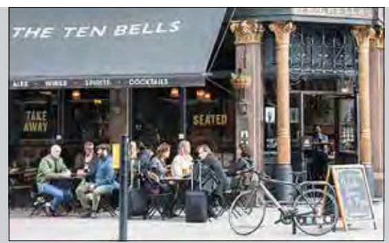
(9) Pubs can now serve inside and out