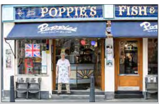
Retro-style fish and chips on Hanbury Street

As you continue into Widegate Street, peer up to four ceramic sculptures created by Philip Lindsey Clark in 1926 to depict the stages of bread-making above the former Nordheim Model Bakery. You'll then emerge onto Bishopsgate, close to Liverpool Street station, the end of your walk.