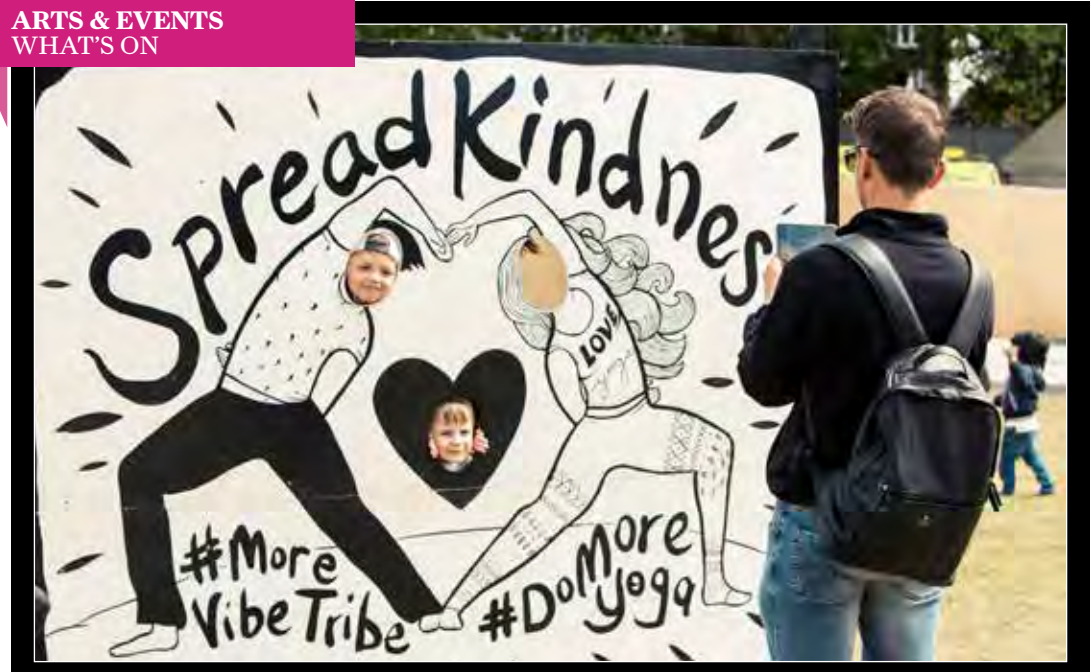
Free fun and yoga sessions at In the Neighbourhood.