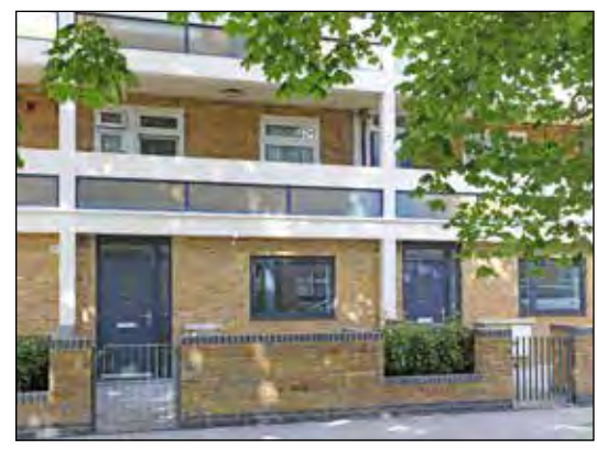
Four new council homes have been built at Mollis House

"Mollis House has ticked all the boxes to accommodate my son's needs. He finds it very difficult to socialise so having a private garden means he is now able to have outdoor space where he can go on a trampoline which helps his muscles and sensory processing needs. He also now has his own bedroom, and we live closer to his school. This is my dream home, and I feel content seeing my son happy."