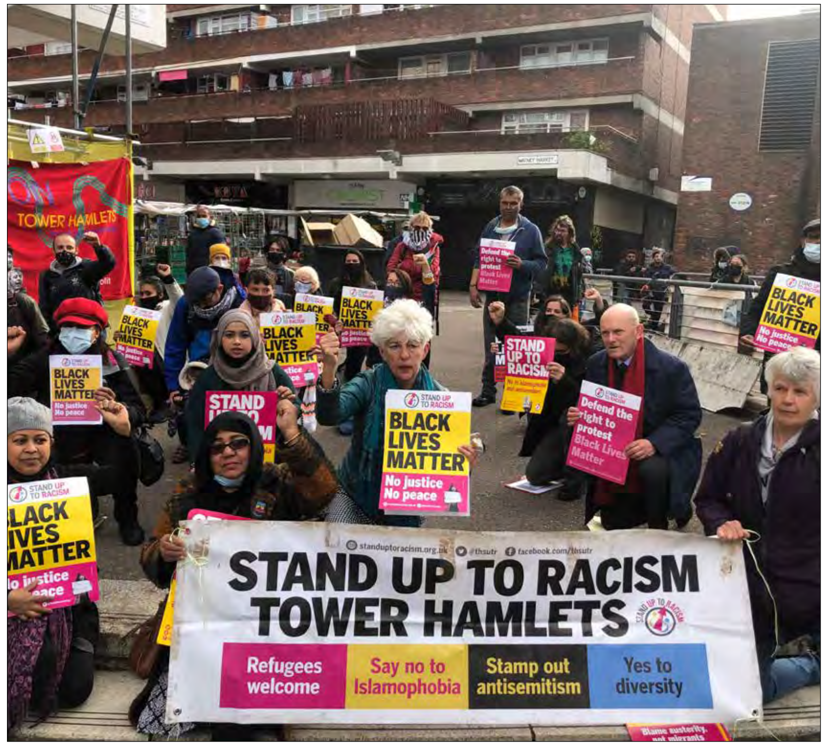
The Stand Up to Racism rally at Watney Market in May