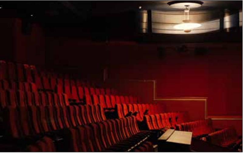
The Genesis auditorium ready for its next audience