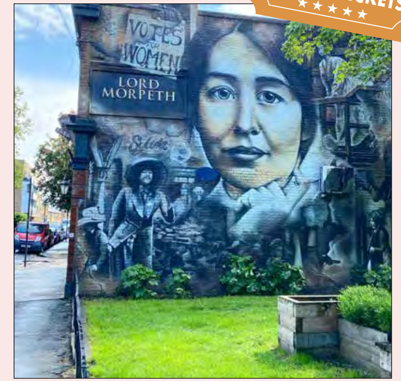
Photo: Mural of Sylvia Pankhurst on the side of the Lord Morpeth pub on Old Ford Road in Bow. Sylvia founded the East London Federation of Suffragettes (ELFS) and was instrumental in helping women get the vote.

The closing date for entries is 8 August 2021. For more information and terms and conditions, visit www. towerhamlets.gov.uk/myeastend