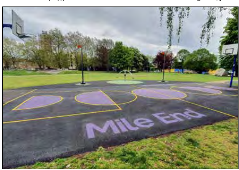
Mark this spot: New surface and markings at the multi-use game area in Mile End Park