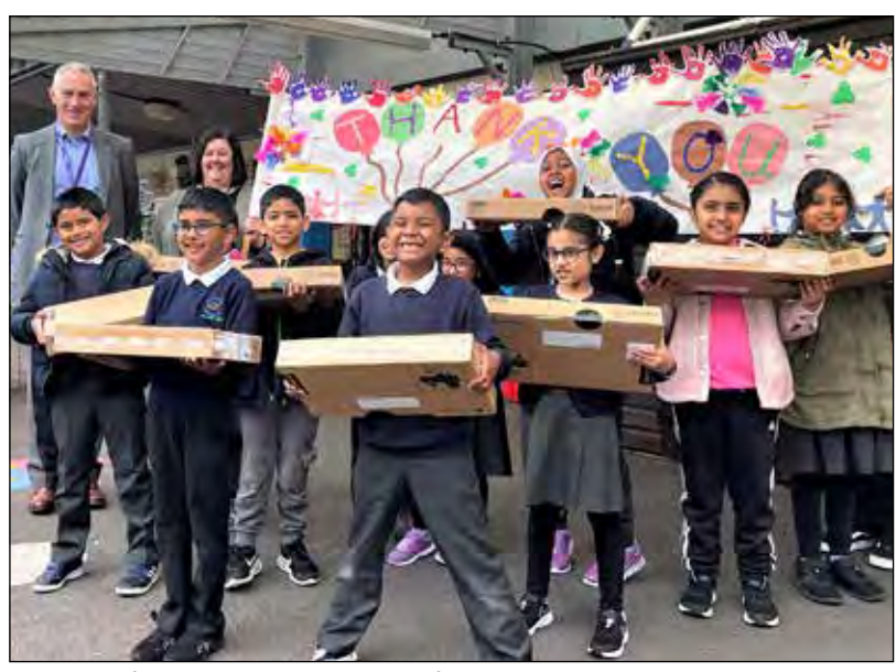
Children from Blue Gate Fields Infants' School receive their laptops

Isa, aged seven, from Blue Gates Field Infants' School, said: "I can learn a lot on my laptop. I can type, read and learn and I don't need to share with my little sister anymore."