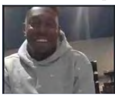
Dizzee joining a group of young people for a creative workshop

area by the charity AccessHE. The workshops explored themes of identity and futures through different forms of creative expression, including comic drawing, digital storytelling and Islamic art. Organiser Beth Hayden said: "To witness the creativity, curiosity and commitment of young people over four weeks, despite all the disruption to their learning over the last year, was truly incredible."