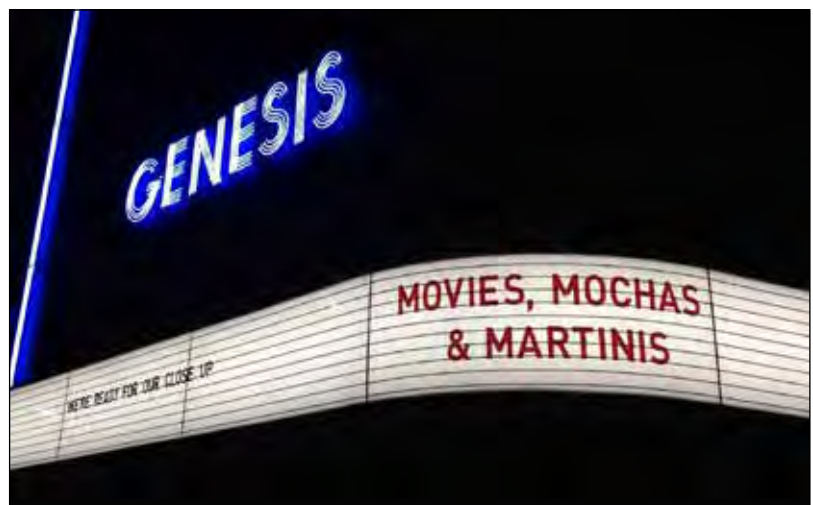
The Genesis recently celebrated its 21st birthday