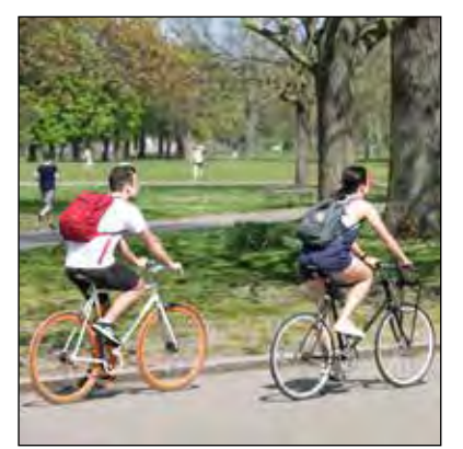
Cycling in Victoria Park

Slimming World offers a healthy eating plan that empowers members