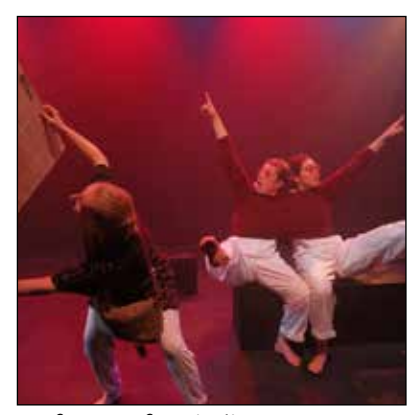
Performers for Finding Percy Erebus