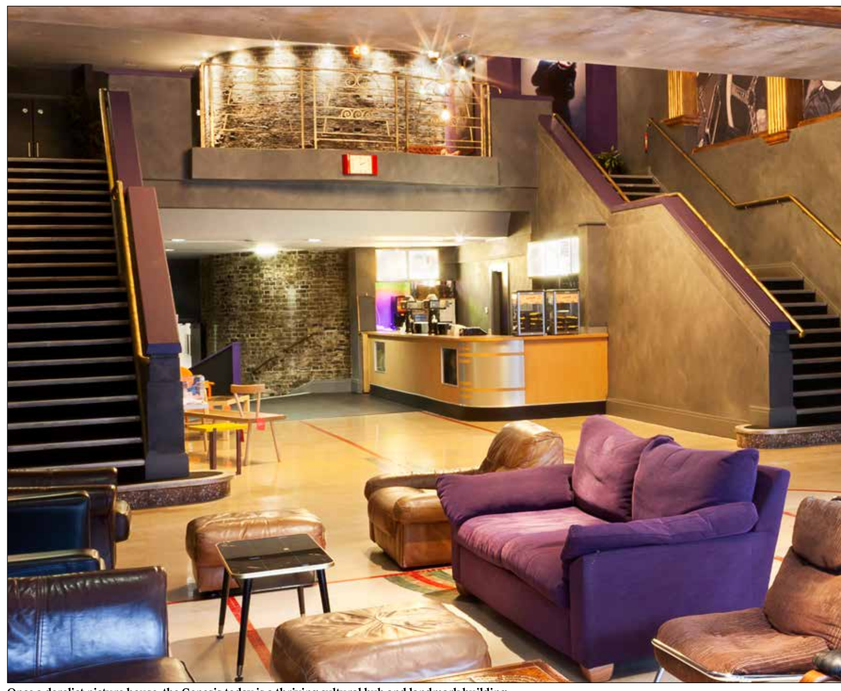
Once a derelict picture house, the Genesis today is a thriving cultural hub and landmark building