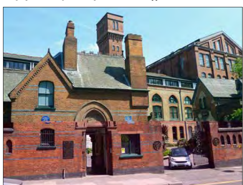
The derelict match factory is now an apartment block, renovated in the 1980s and called the Bow Quarter

As for the grand gothic fountain in front of Bow Station, it, like the station, is long gone, summarily removed in 1953. A hundred yards or so to the east, a plaque on the wall of the former Poplar Town Hall marks the spot (well nearly), celebrating 'the part played by Bryant & May and their work people in securing the abandonment of the proposed match tax.' It's that unusual thing – a memorial to a memorial.