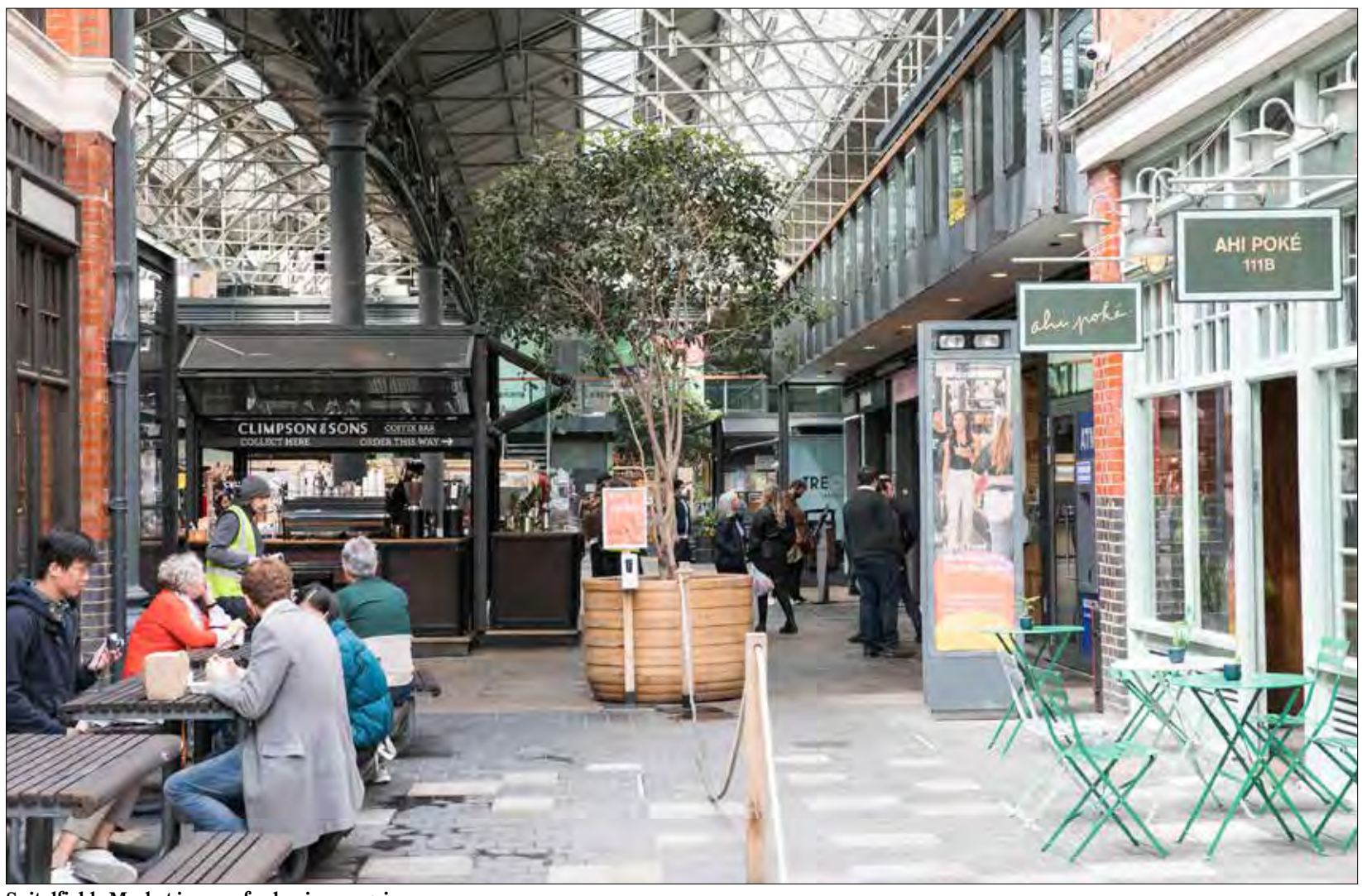
Spitalfields Market is open for business again