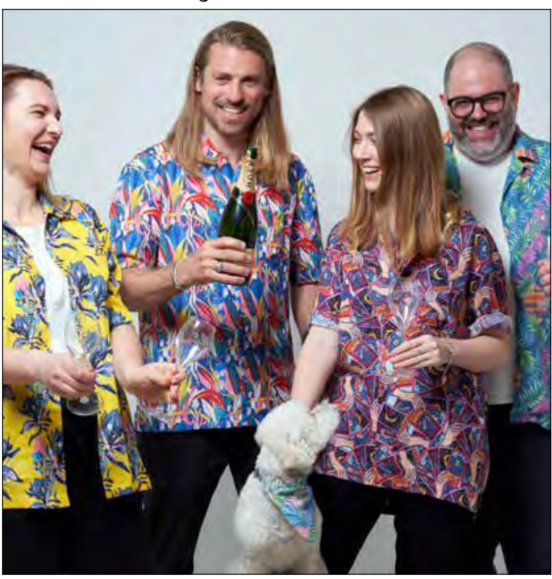
The Boardies team celebrate its award win

past few weeks and it's been going really well, we have all our staff back and it's all looking up.