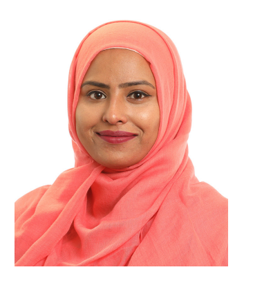
Councillor Asma Begum, Deputy Mayor and Cabinet Member for Community Safety and Equalities