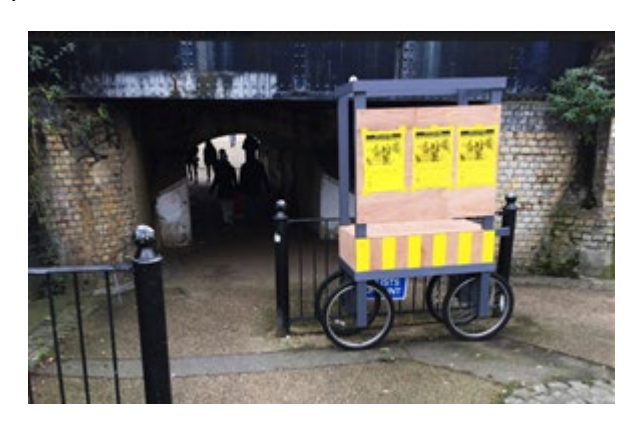
The 'market barrow' used to advertise events

2.3.1 The series of events were publicised through personal contact by the sub-area champions, and by committee members through leafleting. On the day, a 'market barrow' specially built for the purpose and stationed outside event venues was used to display posters for the events.