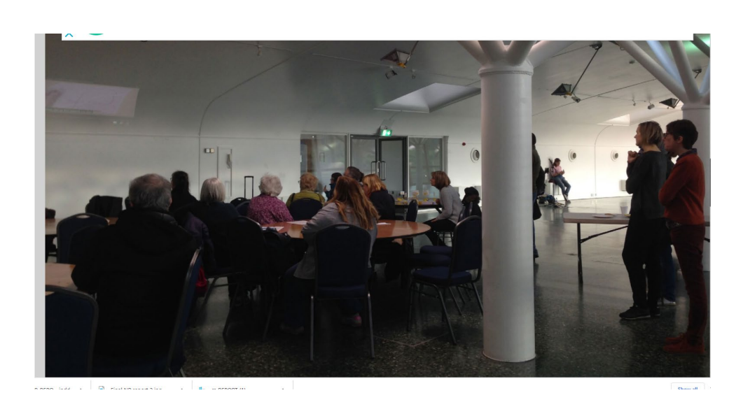
Antill & Meotra event in the Ecology Pavilion