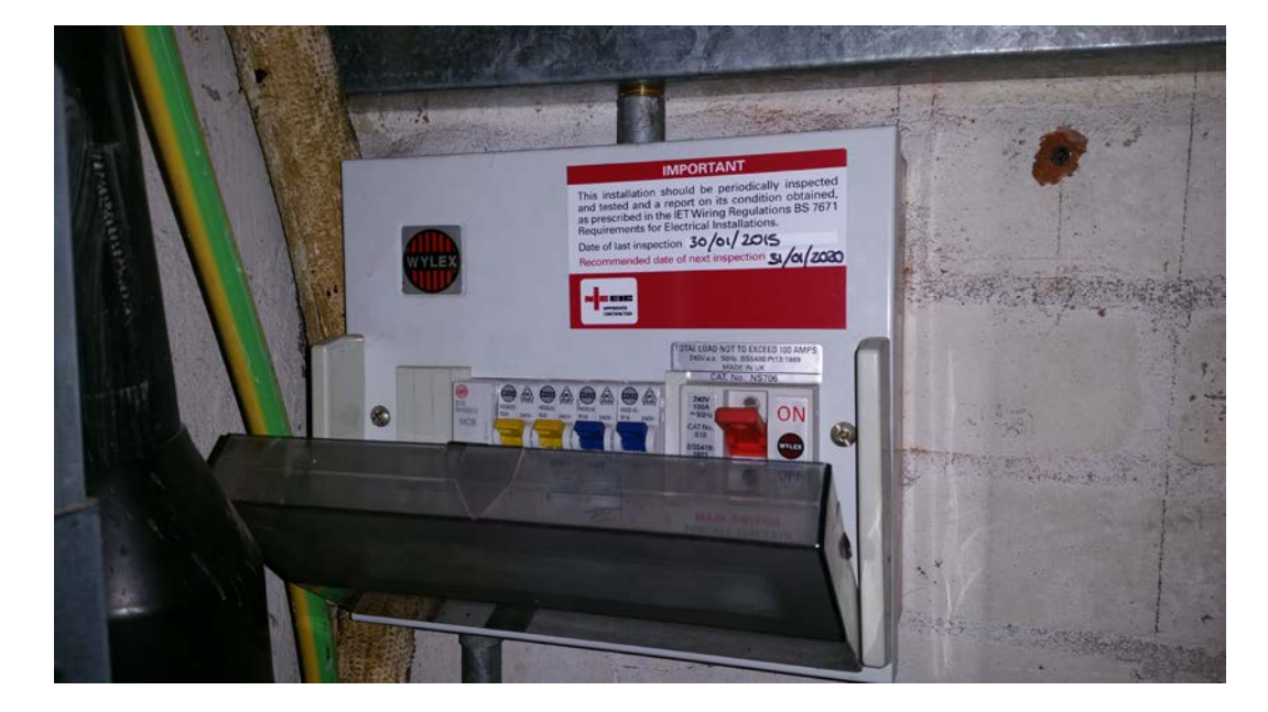
LE2 - Landlord distribution board