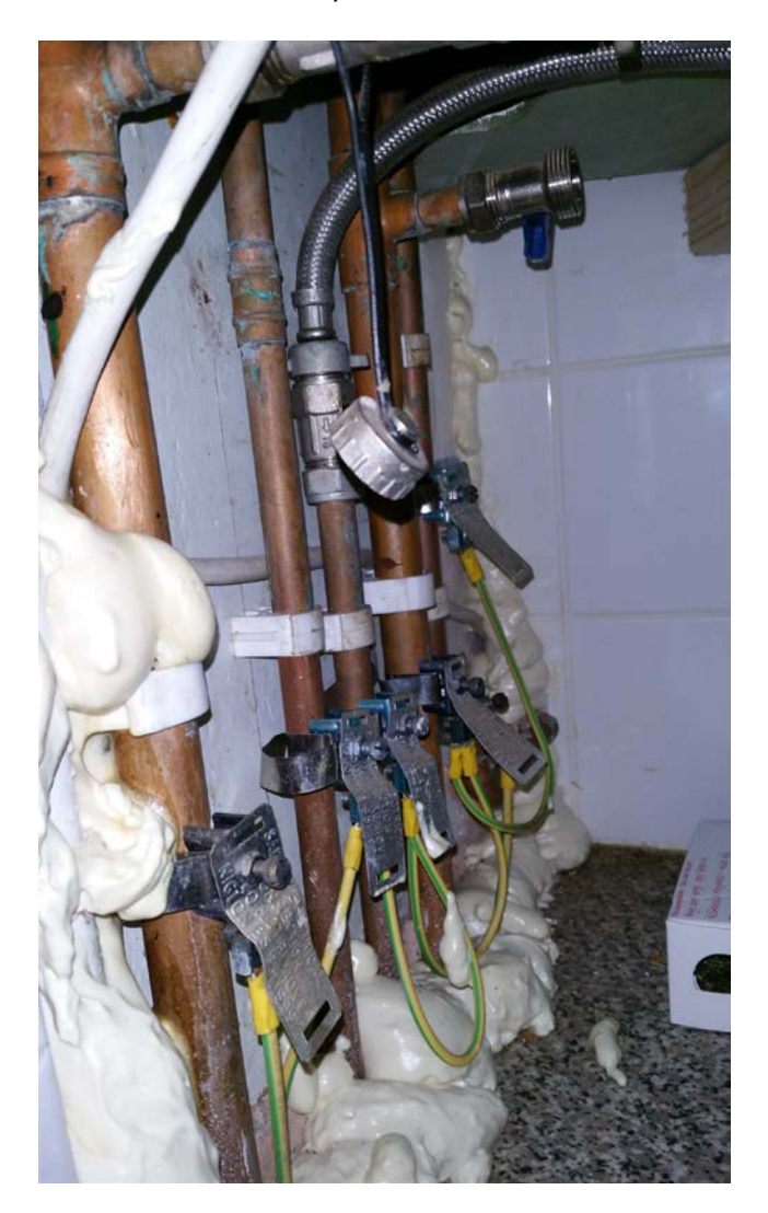
L14 - Copper pipework in kitchen