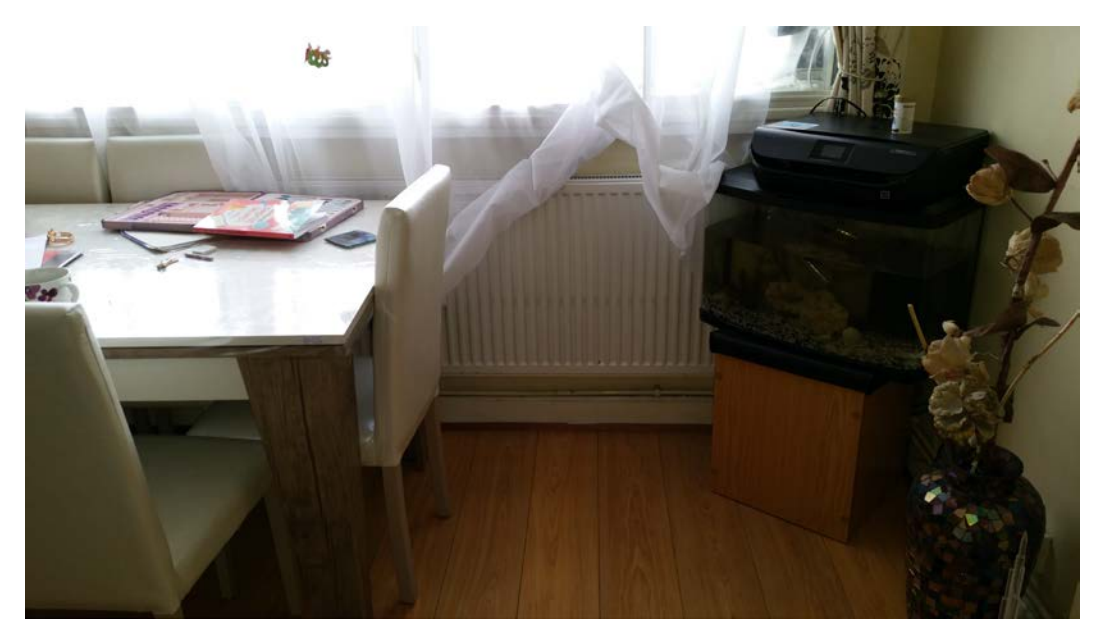
L13 - Steel panel radiators

MECHANICAL & ELECTRICAL SERVICES CONDITION REPORT