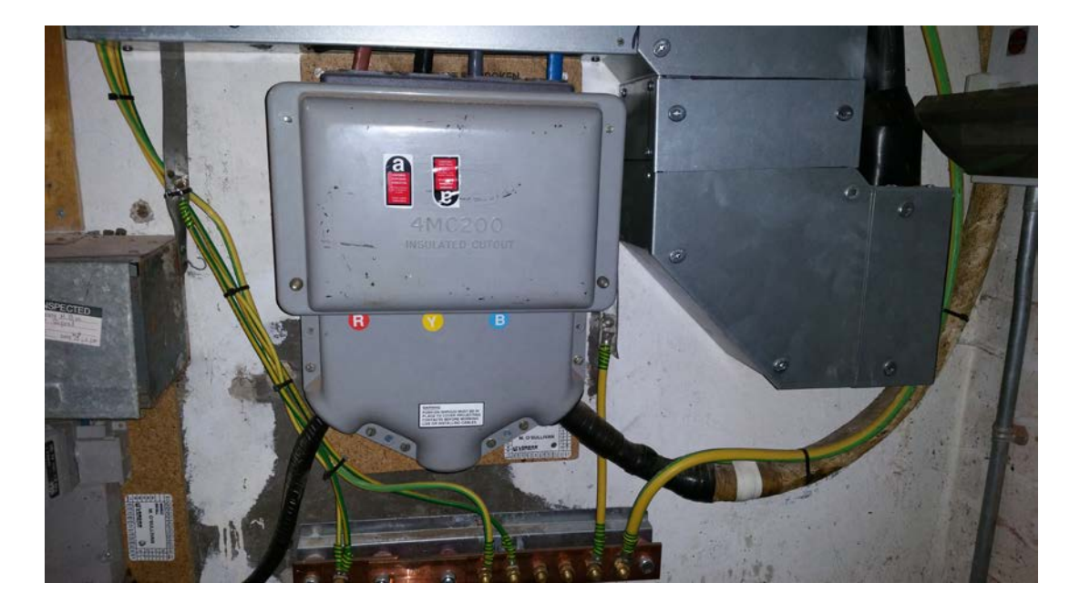
LE1 - Intake electrical head