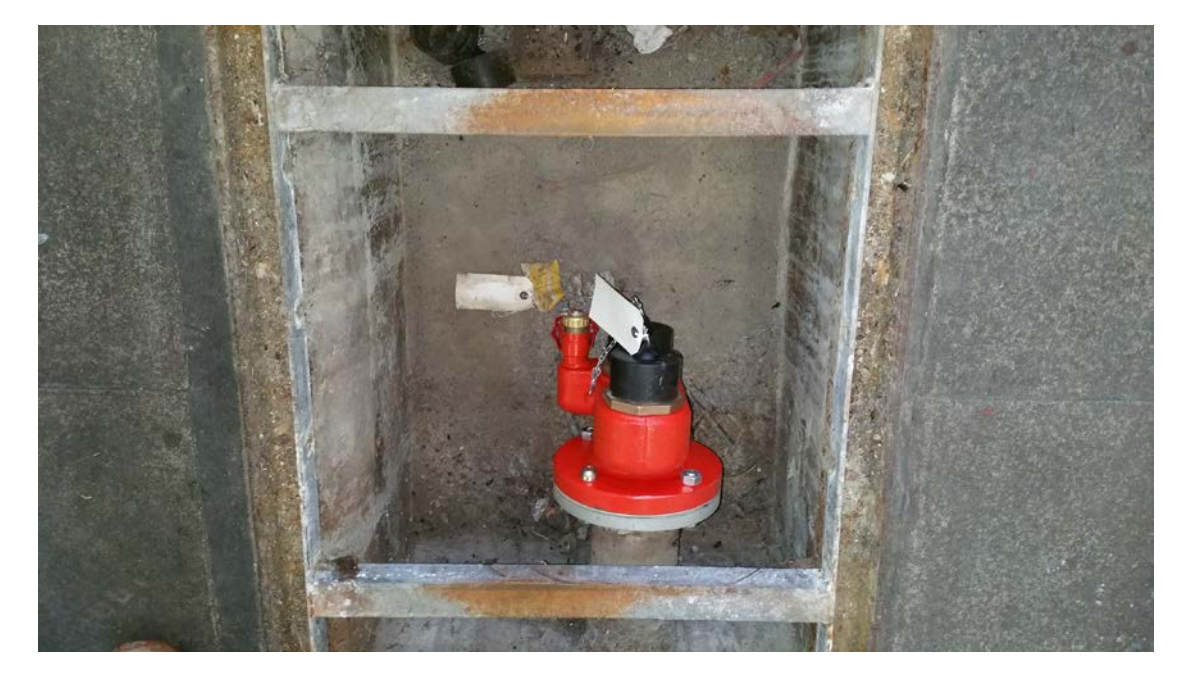
L11 – Dry riser inlet