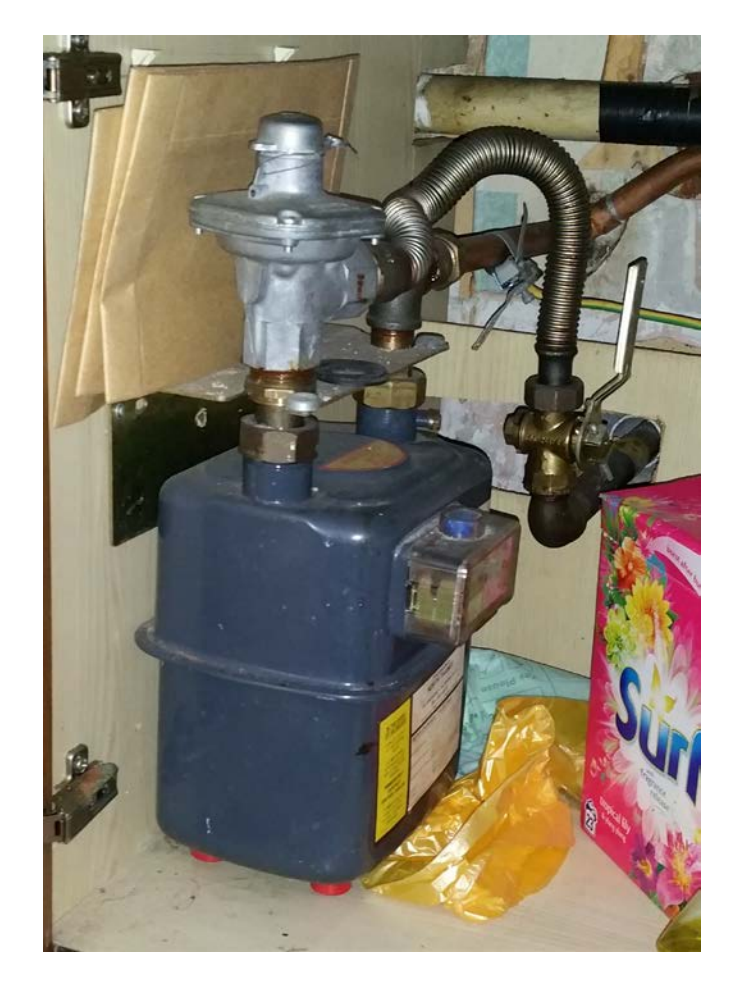
T6 – Gas meter under sink