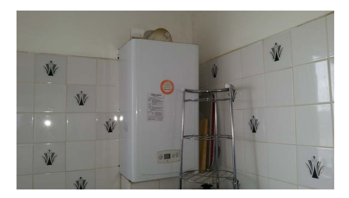
L12 – Heating system boiler in maisonette