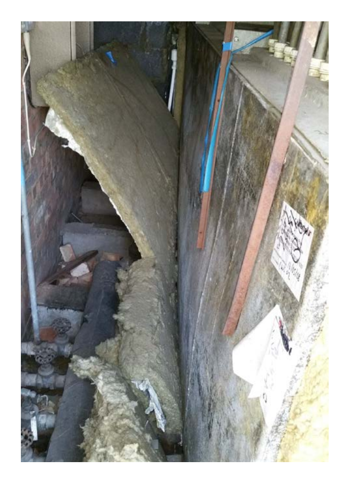
L7 - Cold water down service