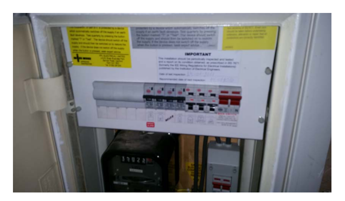
LE8 – Maisonette consumer unit