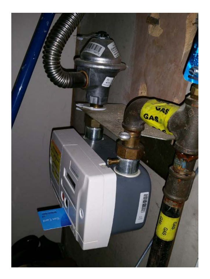
L15 – Gas Meter

MECHANICAL & ELECTRICAL SERVICES CONDITION REPORT