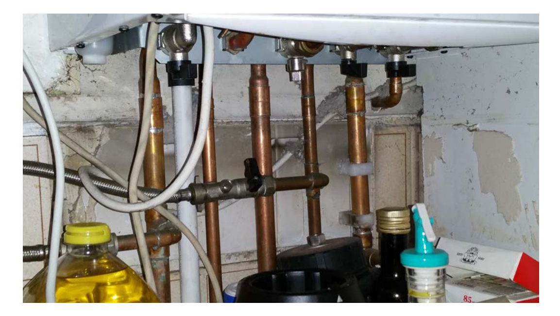
T4 – Pipework from boiler