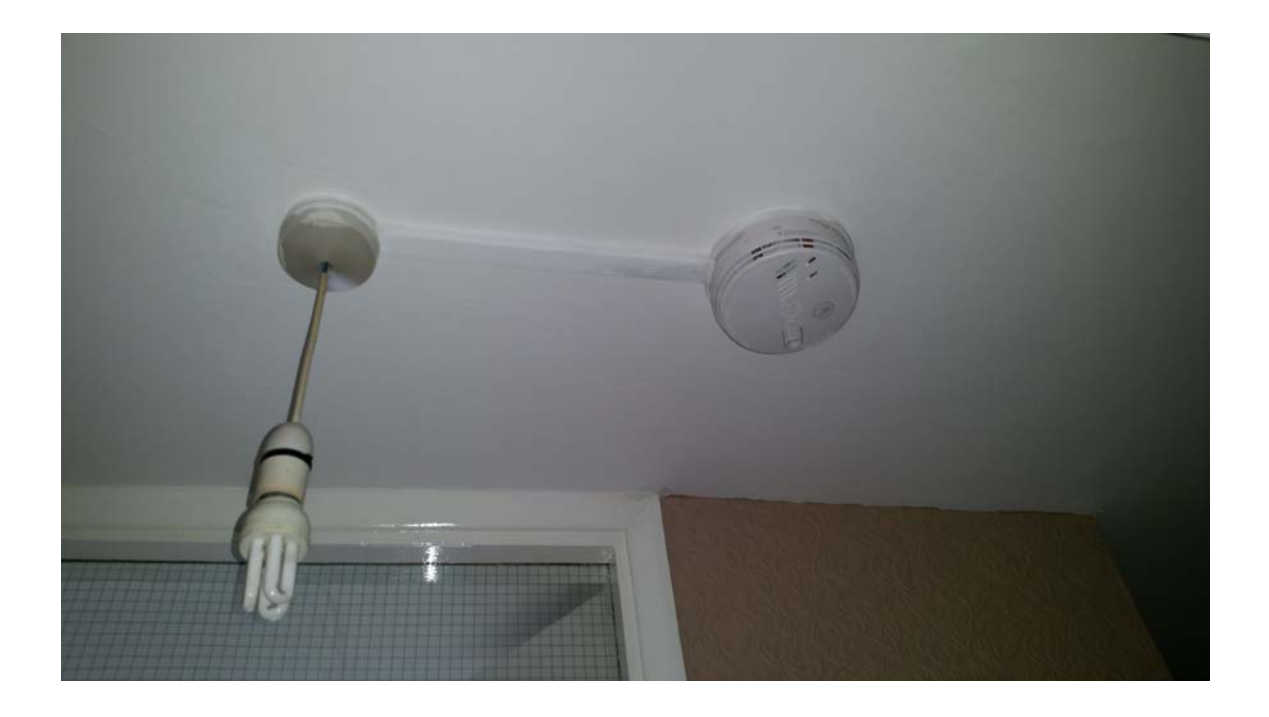
LE11 – Maisonette smoke detectors and low energy lamp