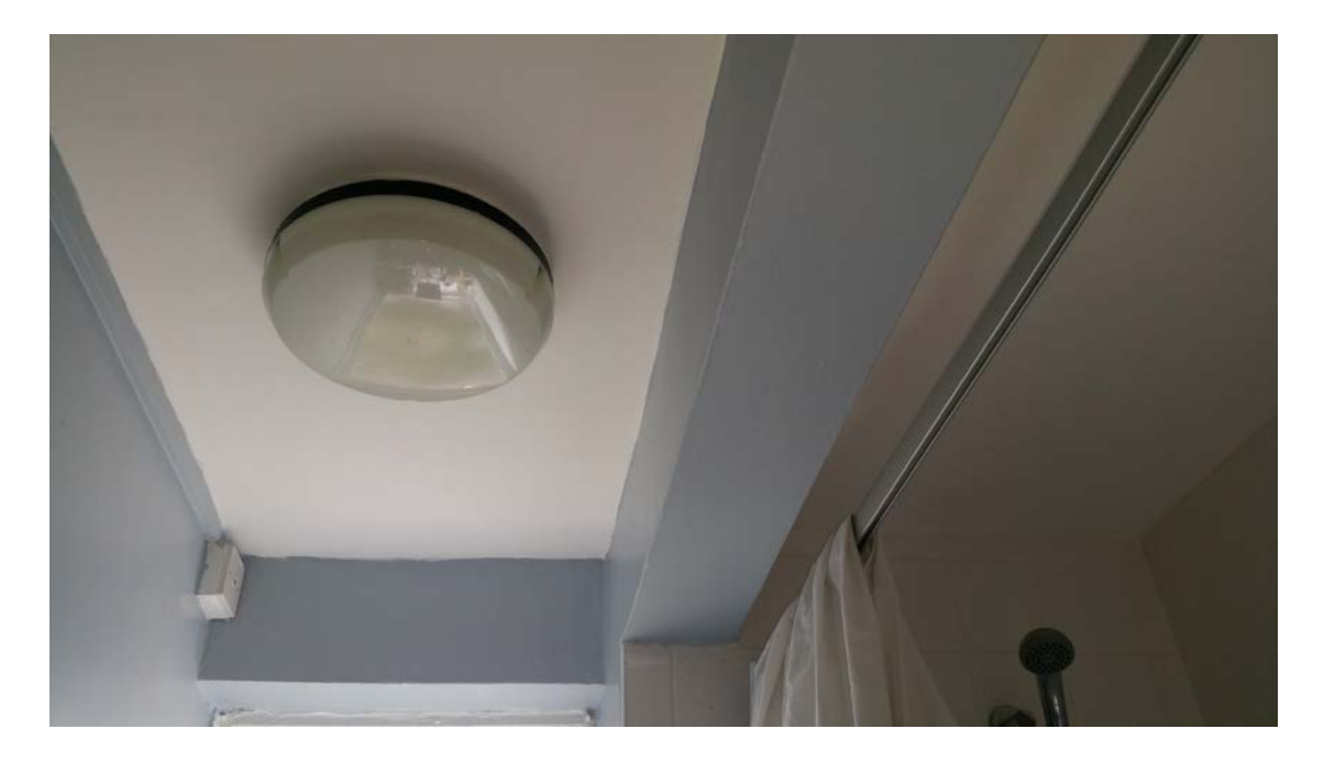
LE10 – Bathroom bulk head fitting 2D

MECHANICAL & ELECTRICAL SERVICES CONDITION REPORT