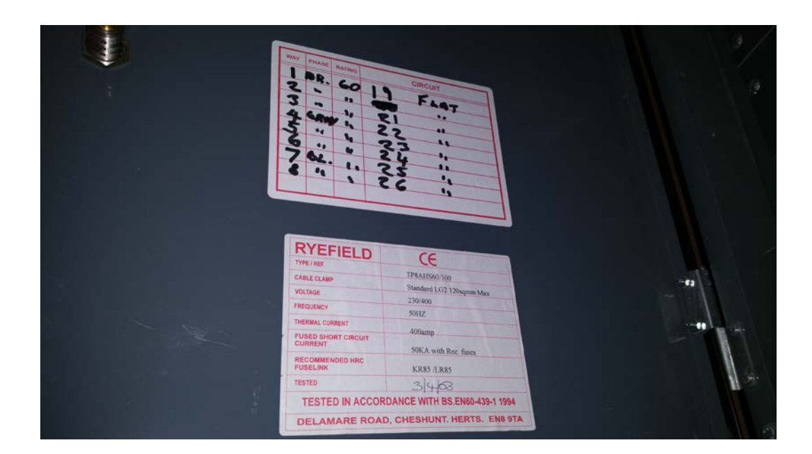
LE3 - Tenant distribution board label