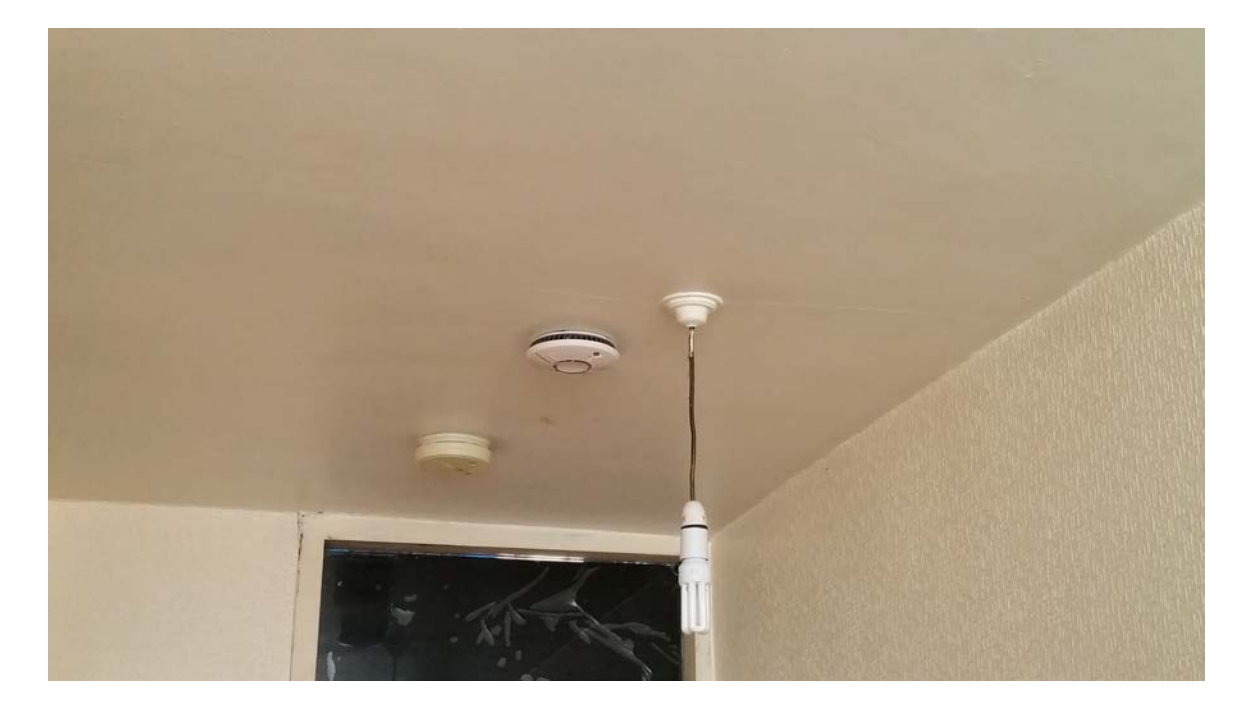
TE3 – Low energy high efficiency lamp