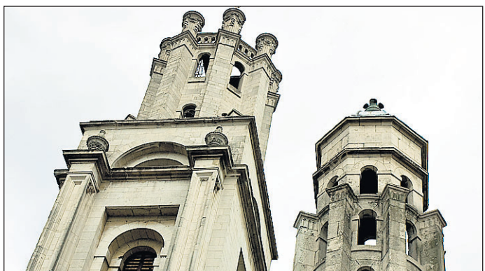
St George's Town Hall in Cable Street