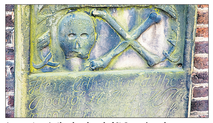
A gravestone in the churchyard of St George's gardens