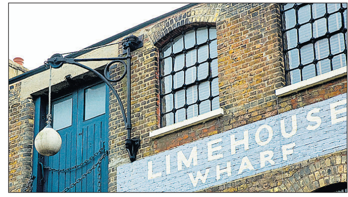
Limehouse Wharf offers a glimpse into our seafaring past