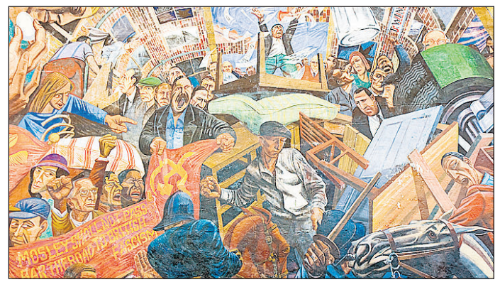
They Shall Not Pass – the mural of the Battle of Cable Street